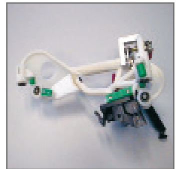
Produced with direct digital manufacturing, this tool is used to attach bumper supports.

Stratasys | www.stratasys.com | info@stratasys.com